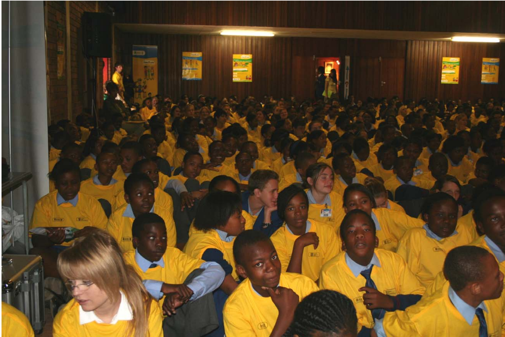
Learners waiting in anticipation for Minister Manuel's address