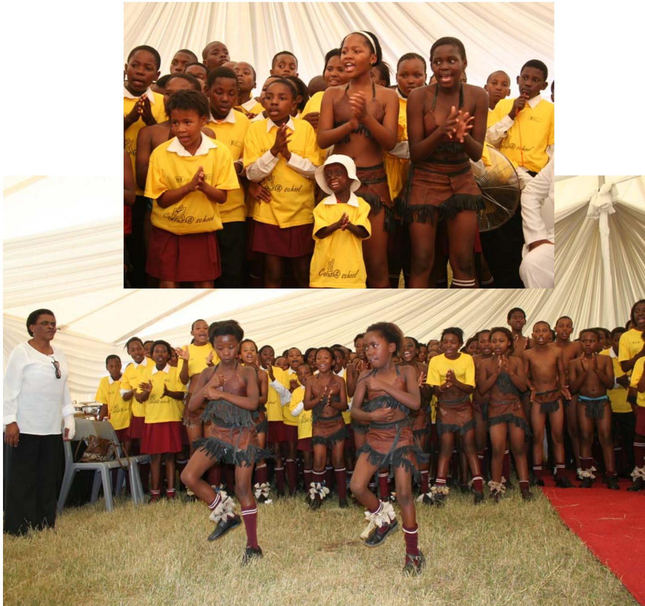
Learners performing at Lorato Primary School in Hebron