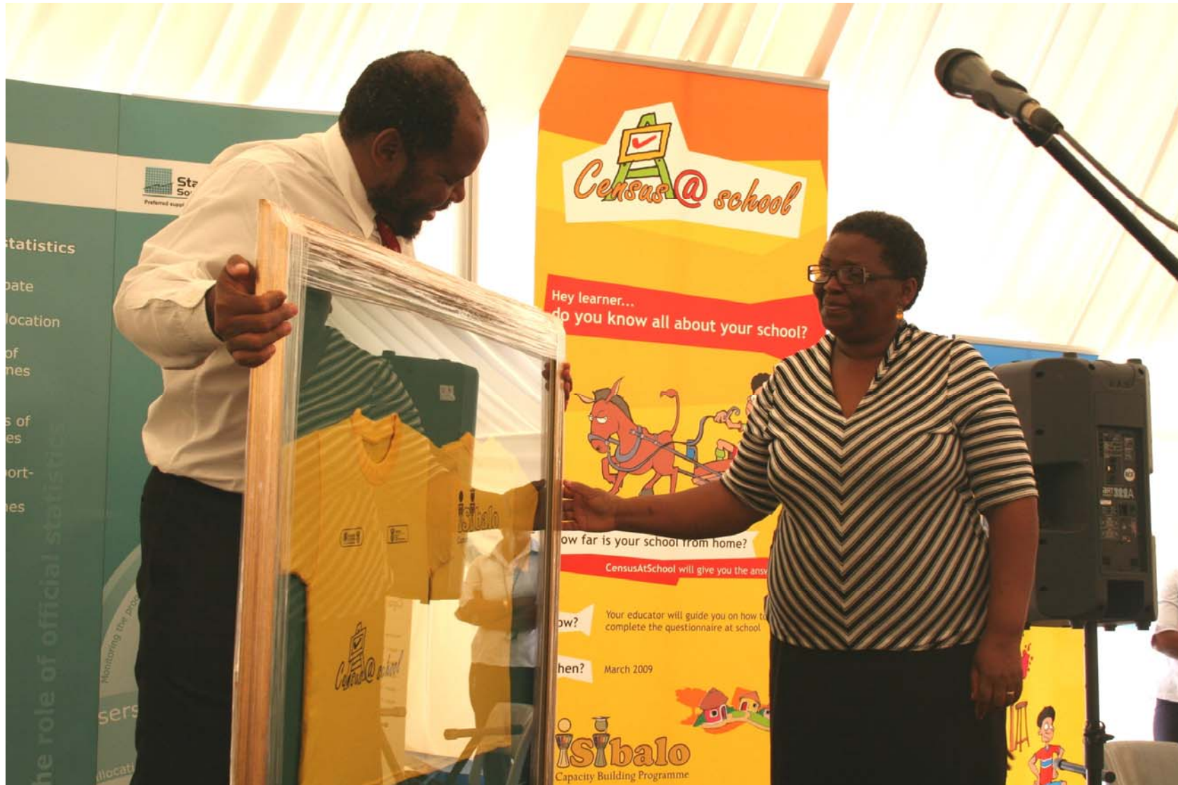
The Statistician-General handing over a token of appreciation to Lorato Primary School