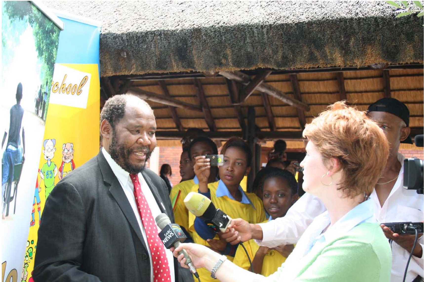
The Statistician-General being interviewed by the media