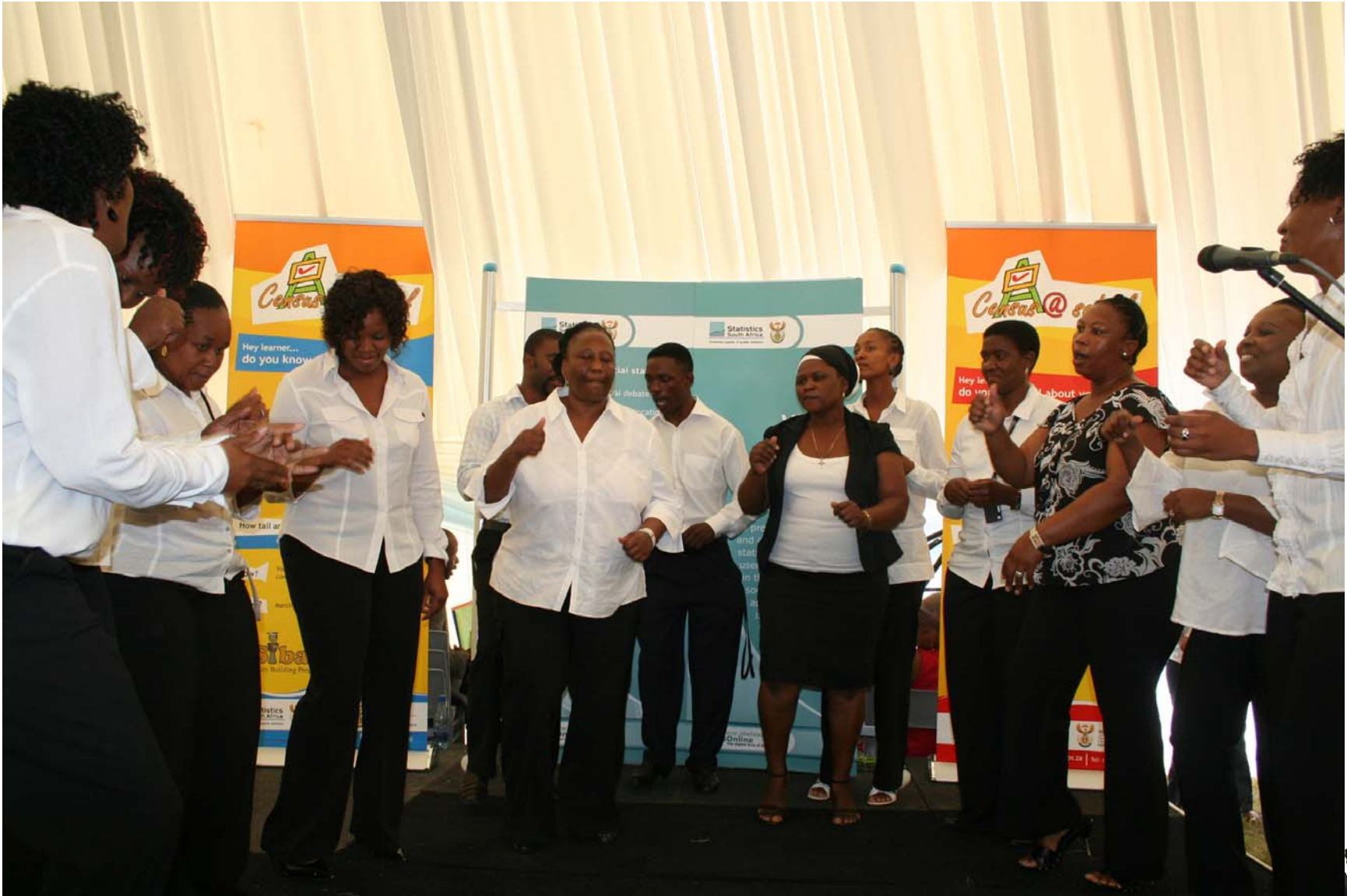
The Stats SA choir entertains the guests